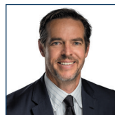
Trent Masters Technology